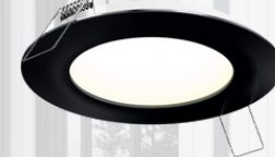
Exterior Potlights (6 inch)