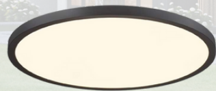
Bedrooms, Hall & Laundry Room Light