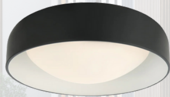
Living Room & Main Bedroom Light