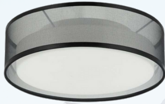
Front Foyer Light