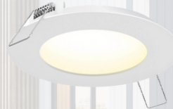
Kitchen & Powder Room Recessed Light (6 inch)