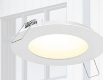
Kitchen Recessed Lights (6 inch)