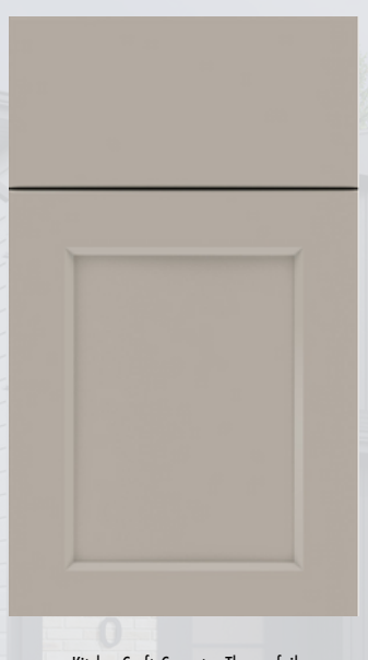
KitchenCraft Coventry Thermofoil -Satin Cosmo