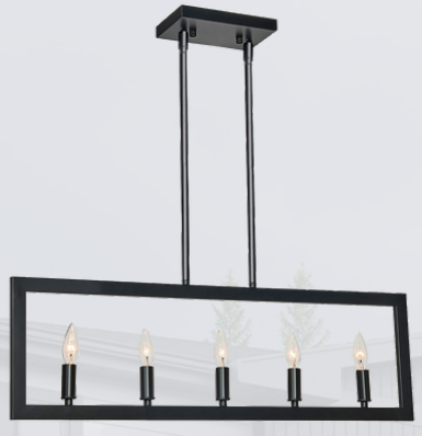
Dining Room Chandelier