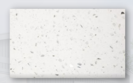
Granite Mountain Quartz - Winter (Kitchen Counters)