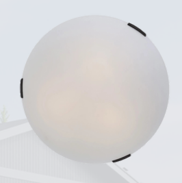
Master Bedroom & Lower Level Flush Light