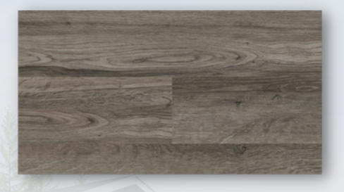
Vinyl Plank - Torlys Rigidwood Firm Premier - Skyline